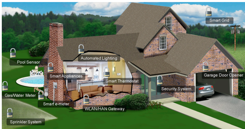
A fully connected smart home showing elements with different levels of security needs

Each link requires different levels of security and is subject to different types of threats or attacks. There is no single approach to securing an application, and the methods as well as their complexity vary depending on the element that needs to be secured as well as the criticality of the information. This paper identifies threats and offers risk mitigation methods for a portion of the system, in this case the sensor nodes that are typically driven by a microcontroller. An example of this can be temperature or lighting control elements, a remote garage-door opener and other similar home automation nodes. A microcontroller is often at the heart of these nodes and depending on the application, the process of closing the security gaps may vary.