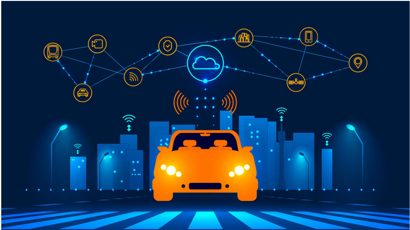
Figure 1. Typical Vehicle-to-world Connectivity Options

Today's vehicles have more intelligence and more connectivity than our mobile phones did 20 years ago. They are in near-constant communication with the world, whether through subscription-based communications services or built-in cellular functionality. In the future, this will include vehicle-to-vehicle communication. The core controlling communication to the outside world is the telematics control unit (TCU) ( Figure 1 ).