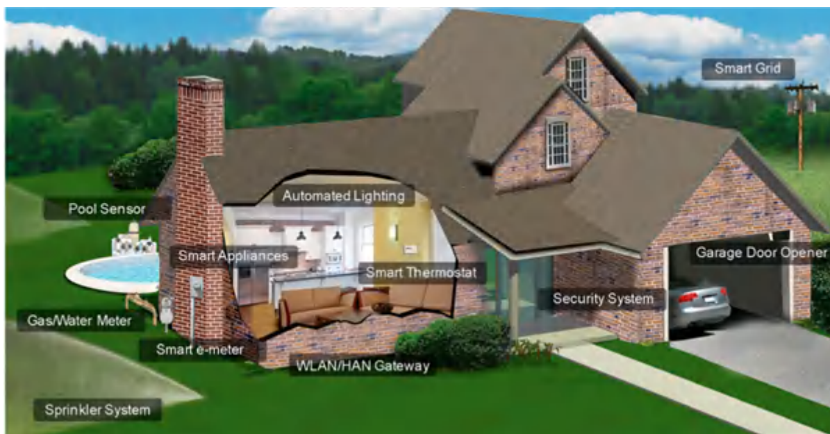
Figure 1. Example of a Smart Home

Advancements in wireless connectivity and low-power embedded processing technology have enabled new applications for smart homes and buildings. Of course, most smart home systems have a control panel or base unit in a fixed location that plugs into the AC power system. But there may also be a number of distributed (and movable) wireless sensors or cameras that are part of the overall system. These peripheral devices are not always near a permanent power source. Figure 1 shows a typical system with multiple remote peripheral devices and a central gateway (controller).